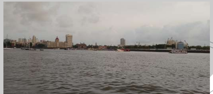
Timeless Beauty - Diana Karanjia