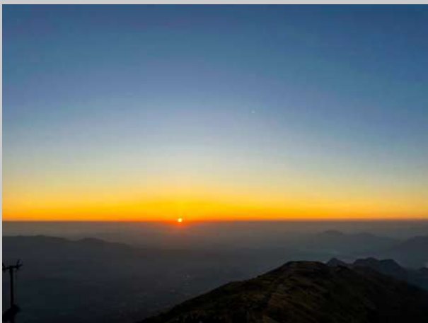
Sunshine isn't for everyone... - Deep Mehta